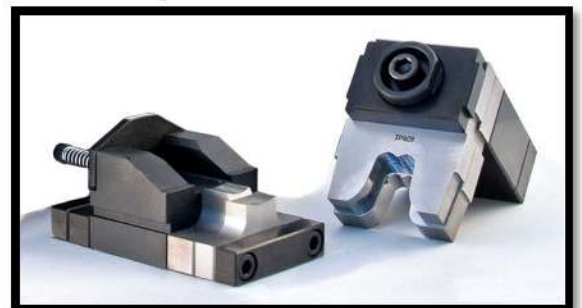
Tool Pack System

To provide the best products, quality, and service in the tooling industry.