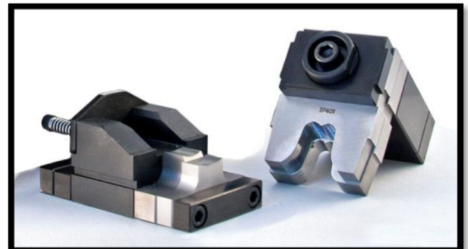
Tool Pack System

To provide the best products, quality, and service in the tooling industry.